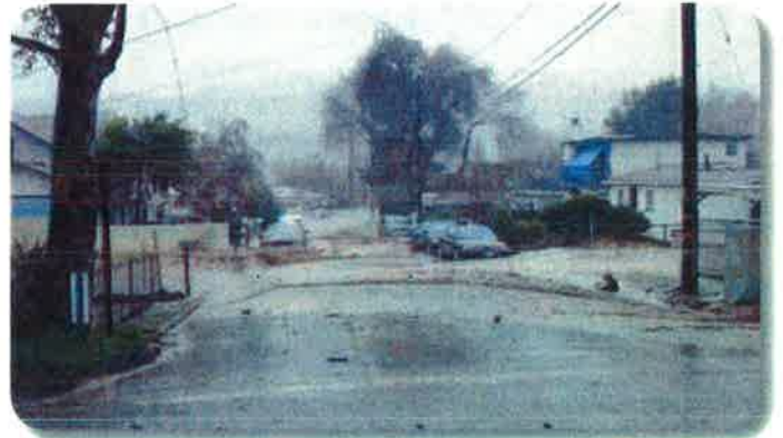
Do not attempt to walk, swim or drive through moving water or flooded areas.