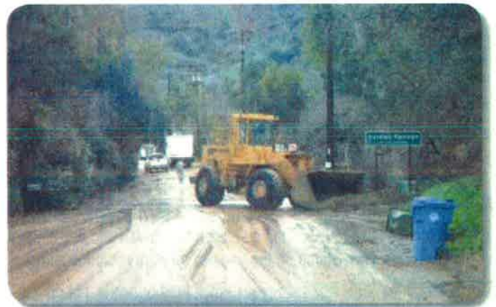
Do not enter a flooded area until it is safe to do so. Flooding can wash out or undermine roads.