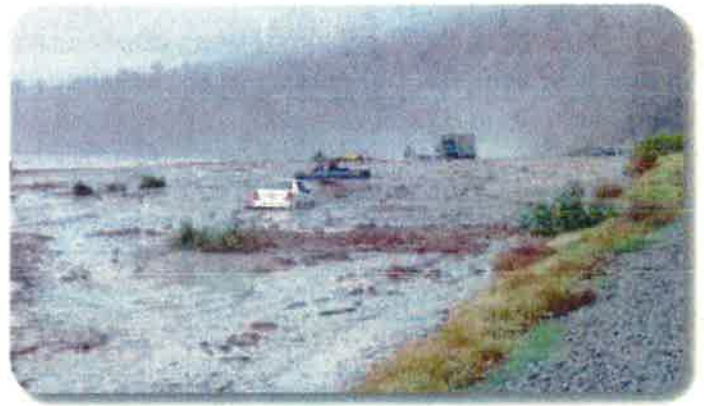
Two feet of water is enough to wash away a passenger vehicle.